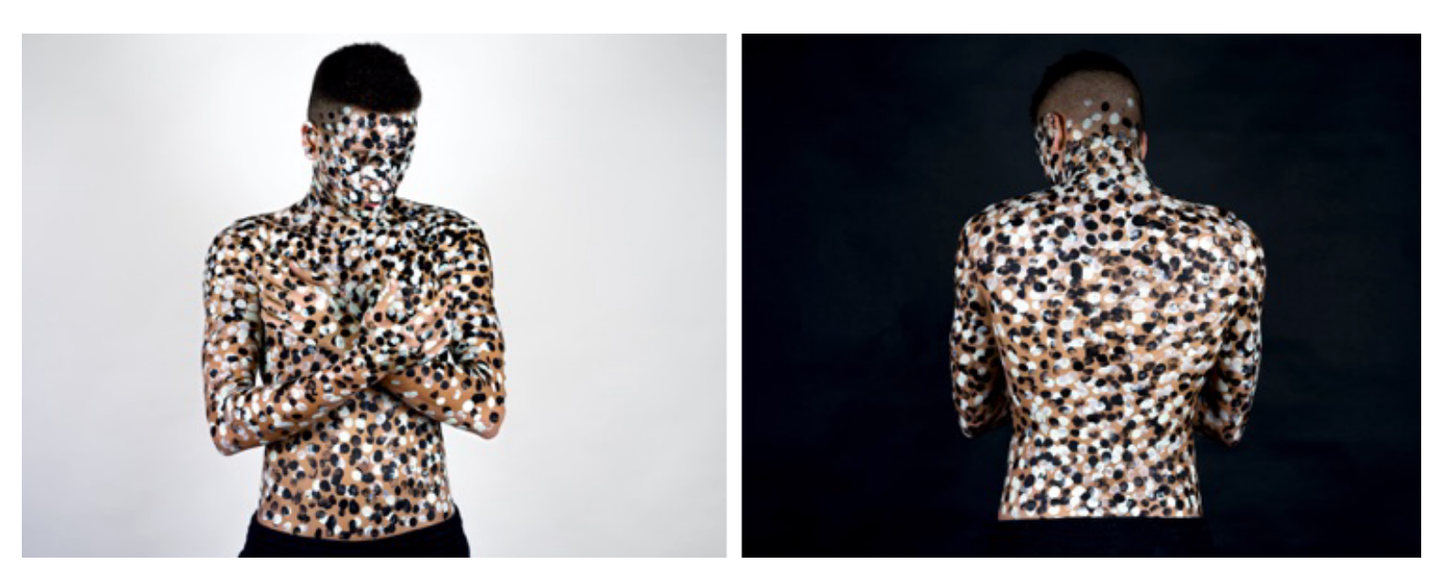
Mwangi Hutter On the Other Side of Midnight 2017 C-prints each 68 cm x 94 cm