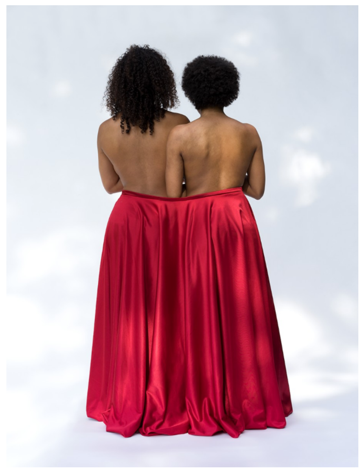
Mwangi Hutter Twinshipping 2016 c-print 110 cm x 84 cm